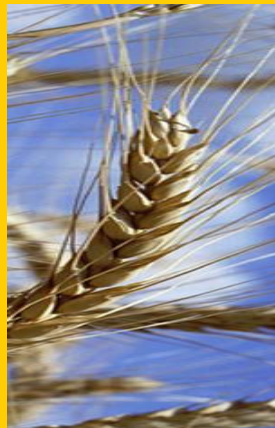
Cereales (rice and durum wheat )

Applied to the 3 main regional agricultural sectors