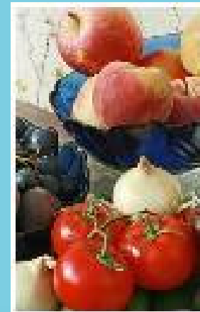
Fruits and vegetables